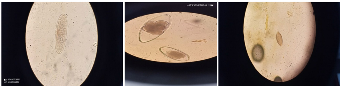
Figure 1. Images of parasite eggs in sheep feces samples.

Also, the Famacha test was used to control parasitic diseases and anemia caused by it. According to the investigations carried out on the last day of the experiment, the lambs were placed in natural light and the color of the inner part of the eyelid and the color of the inner part of the eyelid was compared with the color of the card, and according to