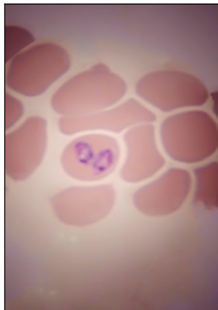
Figure 1. A Positive B. canis sample.

The analysis revealed that out of the 324 blood samples, 42 samples were infected with B. canis , indicating an infection rate of 12.96% (Figure 1). Among the infected samples, 13.02% were male dogs, including 5 samples of stray dogs under 6 months, 8 samples of stray dogs between 6 months and 1 year, 8 samples of guard or herding dogs older than one year, and 12 samples of guard or herding dogs older than one year. Additionally, 12.87% of the infection was observed in female dogs, including 6 samples of stray dogs older than one year and 3 samples of guard or herding dogs older than one year (Chart 1). Finally, 12.71% of infection was observed in Shiraz city (15 sample), 14.94% in Kazerun city (13 sample), 8.92% in Fasa city (5 sample), and 14.28% in Jahrom city (9 sample) (Chart 2). The infection samples were more in male instead of females (25 male sample and 17 female sample) and the infection rate was much higher in stray dogs and dogs with age of one year or older with 15.11% and 16.43% respectively.