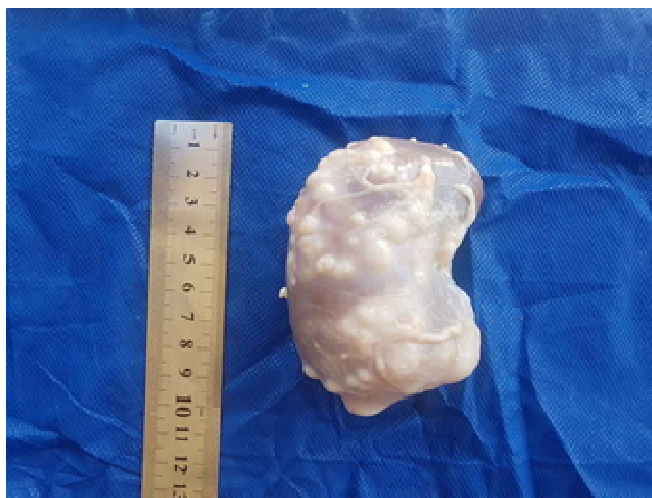
Figure1. Diffuse abscess on the kidney surface

As discussed above, renal insufficiency can be caused by many conditions which their causes are difficult to determine. Thus, abattoir surveys like the present study may play important roles in such areas to find the high frequency lesions and make a solid plan to avoid or prevent exposure to probable etiological agents.