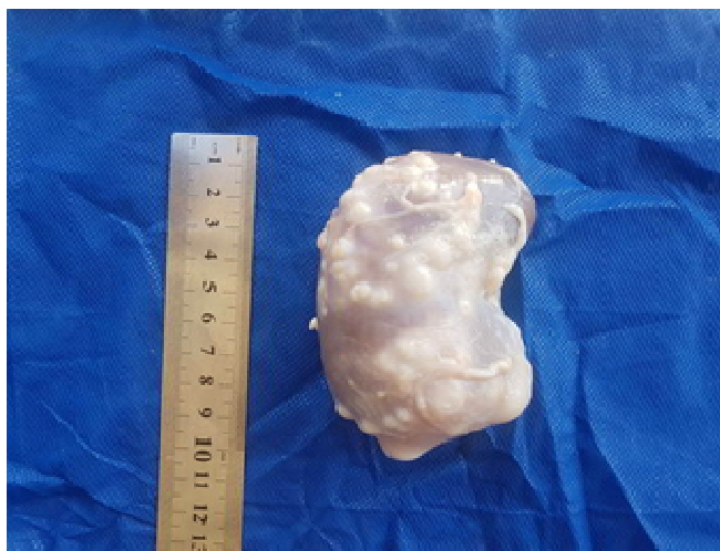
Figure1. Diffuse abscess on the kidney surface

As discussed above, renal insufficiency can be caused by many conditions which their causes are difficult to determine. Thus, abattoir surveys like the present study may play important roles in such areas to find the high frequency lesions and make a solid plan to avoid or prevent exposure to probable etiological agents.