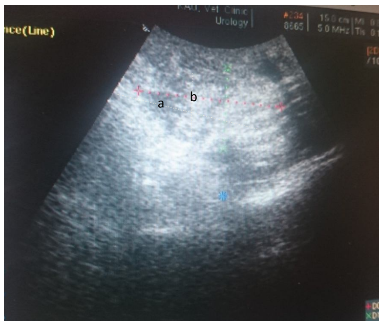
Figure 2. Transverse ultrasonographic image from the prostate indicating the measured parameters