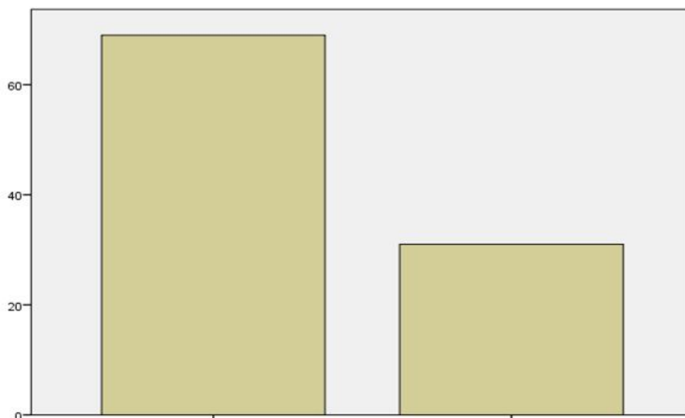
Figure 2 .The percentage of frequency of negative and positive results