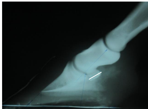
Fig.2. Lateromedial radiograph from the hind distal phalanx of a normal horse that indicating the Proximal-distal border length of the navicular bone (navicular width).