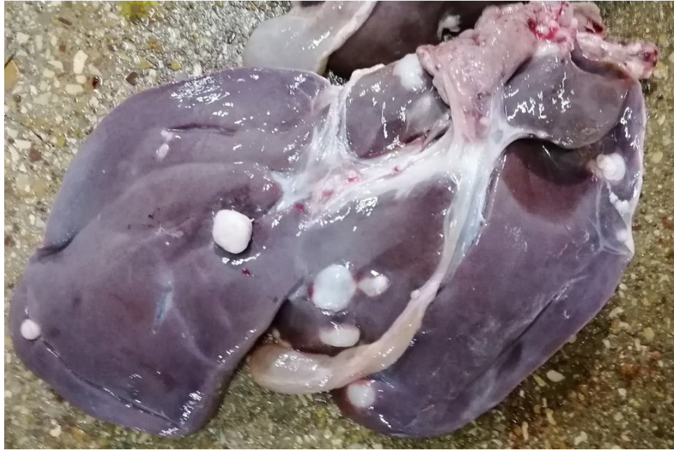
Figure 1. Different sizes of abscess are seen on the liver surface. Note the calcified abscess.