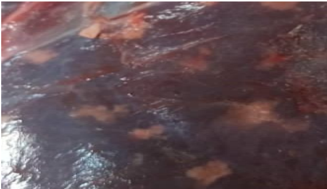
Figure 4. Focal necrosis on liver surface.

Fatty livers were bigger than normal pale and swollen with an irregular surface and yellowish-brown color. In microscopic view, the hepatocytes were swollen, and large spherical vacuoles were. Mild inflammation was present in one slide. In cases with cysticercosis macroscopic yellowish-white