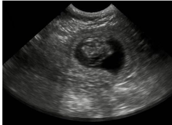
Figure 1. Transrectal ultrasonogram of uterus of sheeps at day 25 to 30 of gestation with a 7.5 MHz transrectal transducer showed accumulation of anechoic fluid in uterus.

In the present observations, there was a rapid growth of internal organs around and after day 76 of gestation. The scrotum in the male fetus was identified on the 81nd day of gestation. In earlier studies, genital tubercle has been reported by various investigators. Between 110 and 120 days of gestation complete details of the fetal stomach, heart, liver, gall bladder, kidney, and urinary bladder were seen in 2D ultrasonographic images (Figure 3).