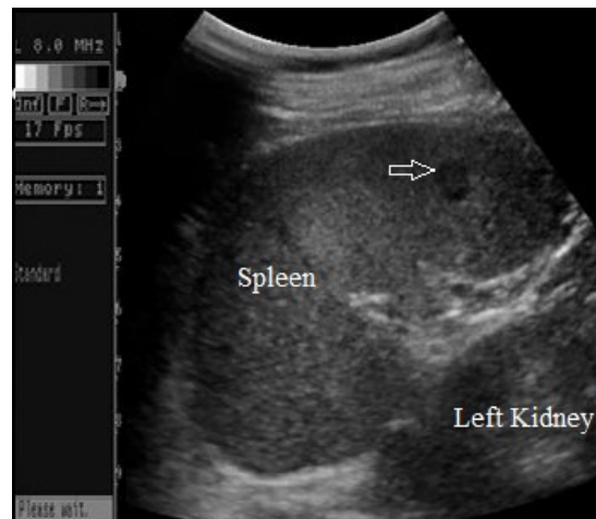
Figure 1. Sagittal sonogram of splenic hemangiosarcoma (arrow) in a 10-year-old male hybrid dog.