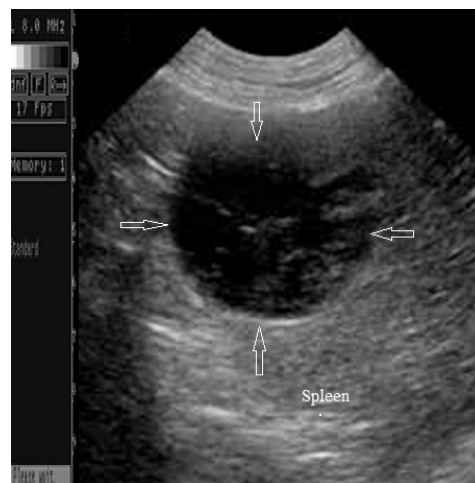
Figure 2. Sagittal sonogram of splenic leiomyosarcoma (arrows) in a 13-year-old female German Shepherd.