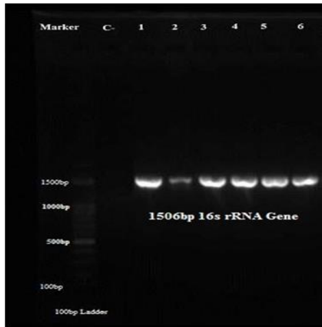
Figure 2. PCR amplicons of 16S rRNA genes in six bacteria isolated from Khoshk river. Lane A: Ladder; lane B: negative control, Lane 1: R1, Lane 2: R2, Lane 3: R3, Lane 4: R4, Lane 5: R5, Lane 6: R6