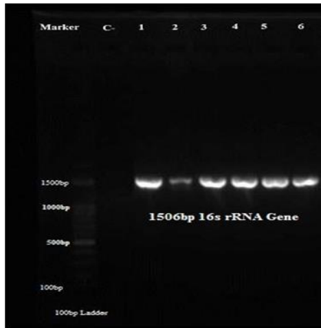
Figure 2. PCR amplicons of 16S rRNA genes in six bacteria isolated from Khoshk river. Lane A: Ladder; lane B: negative control, Lane 1: R1, Lane 2: R2, Lane 3: R3, Lane 4: R4, Lane 5: R5, Lane 6: R6