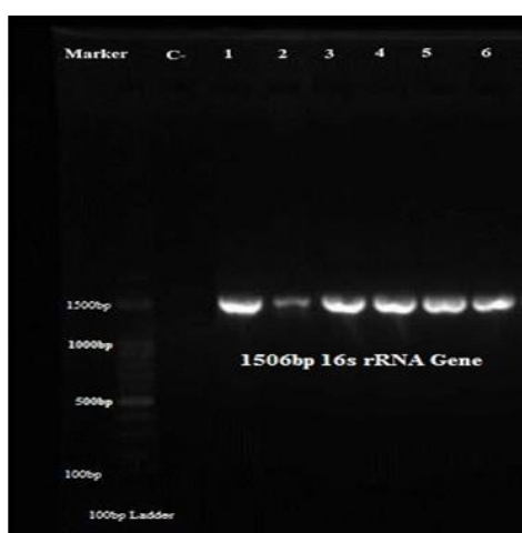
Figure 2. PCR amplicons of 16S rRNA genes in six bacteria isolated from Khoshk river. Lane A: Ladder; lane B: negative control, Lane 1: R1, Lane 2: R2, Lane 3: R3, Lane 4: R4, Lane 5: R5, Lane 6: R6