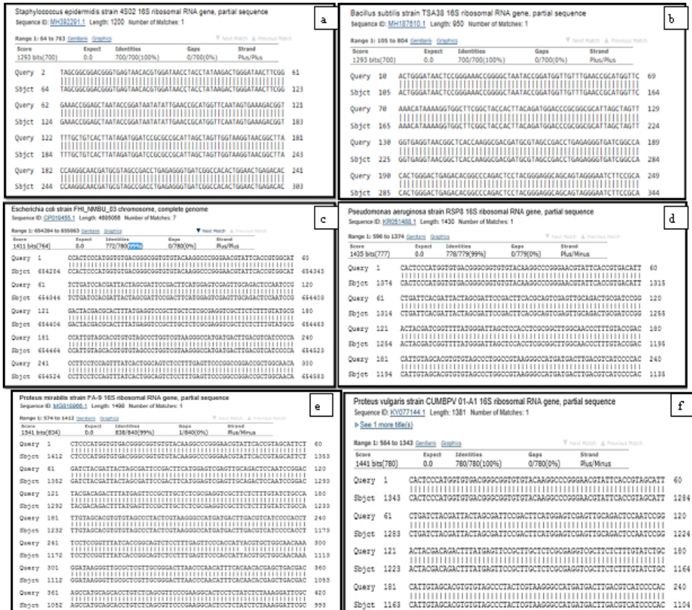
Figure 3. 16S rRNA Sequences in isolates R1 ( Staphylococcus epidermidis ) (a), R2 ( Bacillus subtilis ) (b), R3 ( Escherichia coli ) (c), R4 ( Pseudomonas aeruginosa ) (d), R5 ( Proteus mirabilis ) (e) and R6 ( Proteus vulgaris ) (f).

The Fe, Hg, Pb, Zn, Cd, Ni, Cr and Co concentrations used during screening ranged from 0.05 – 1 mM. Each isolate differed in their MIC values for different metals but the general order of resistance to the metals was found to be as Pb > Hg > Ni > Co > Cr > Cd >