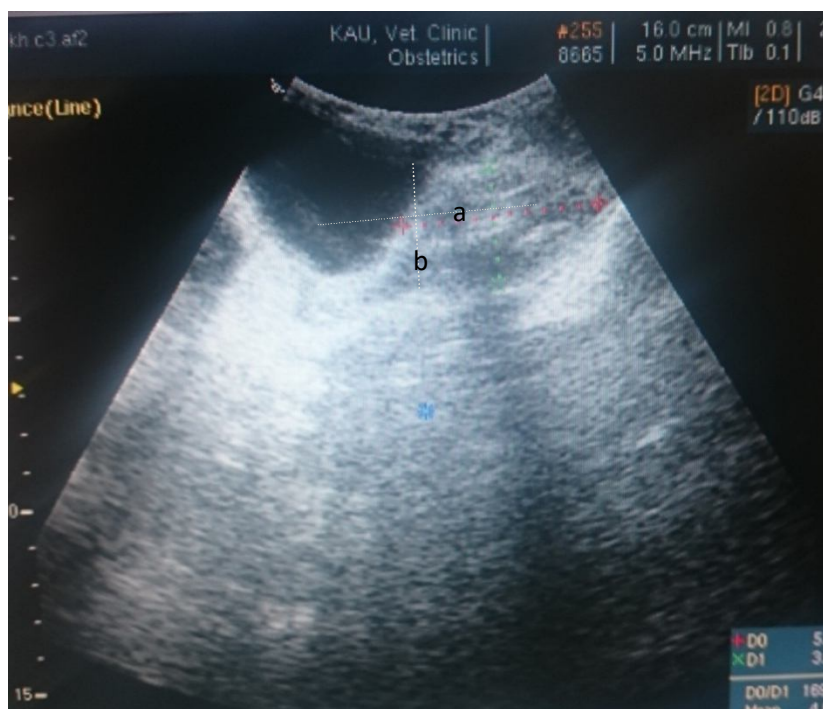
Figure 1. Sagittal ultrasonographic image from the prostate indicating the measured parameters