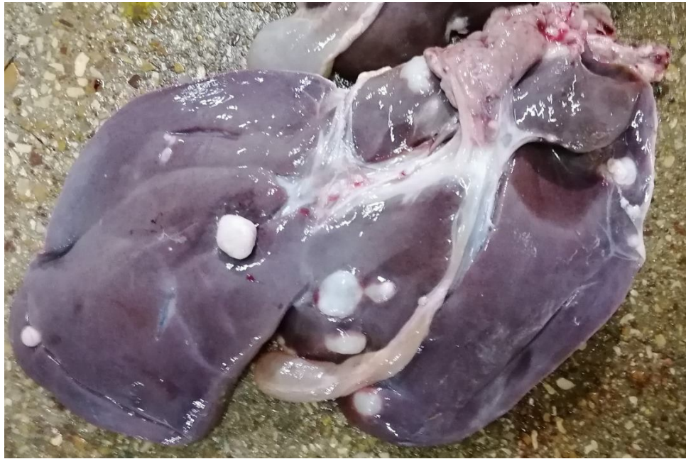
Figure 1. Different sizes of abscess are seen on the liver surface. Note the calcified abscess.